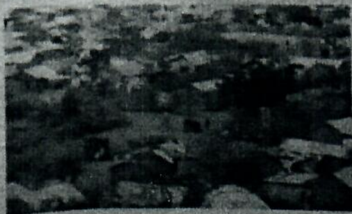
Displaced refugees in Kenya. /PHOTO

Refugee students who were B-grade students in their first term, failed to meet their goals.