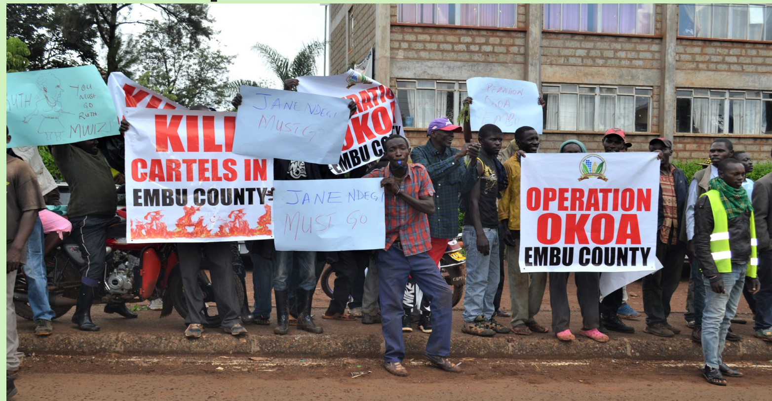
Residents of Embu displaying placards outside the County Assembly to protest against increased cases of graft in the County Government as repeatedly exposed by Ward Representatives

Embu town was a no go zone as angry residents, led by their Ward Representatives took to the streets to protest against rampant corruption in the County Government.